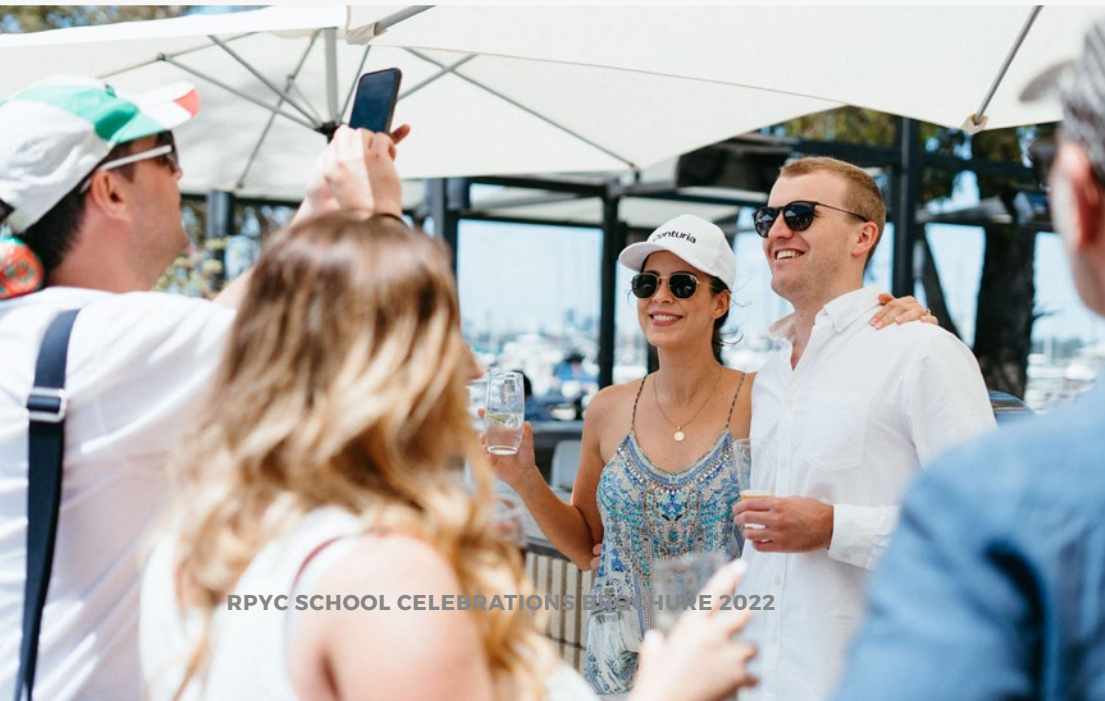
RPYC SCHOOL CELEBRATIONS EXHIBITION 2022