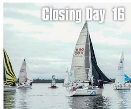
Closing Day 16