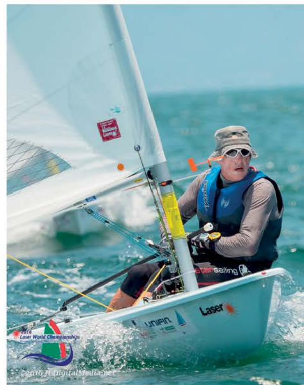
■ Masters Standard Day 6.