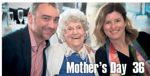
Mother's Day 36