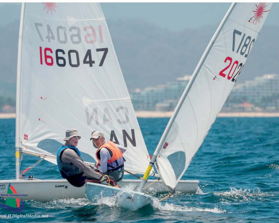
■ Last race just ahead of the Canadian.