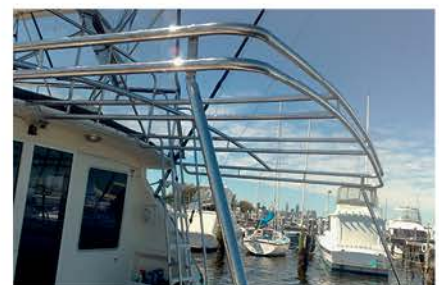
• S/S & Ally Welding/Fabrication