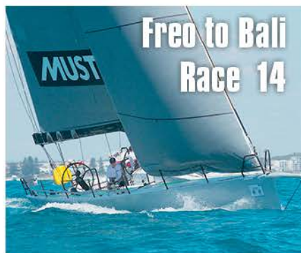
Freo to Bali Race 14