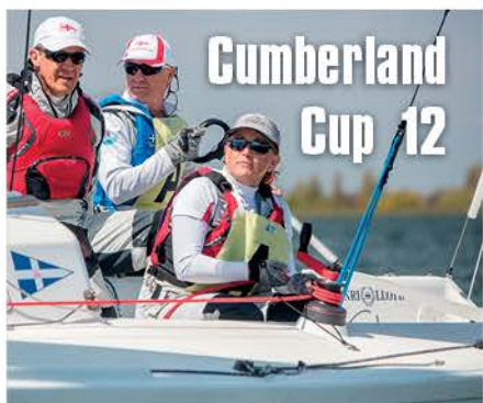
Cumberland Cup 12