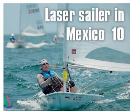
Laser sailer in Mexico 10