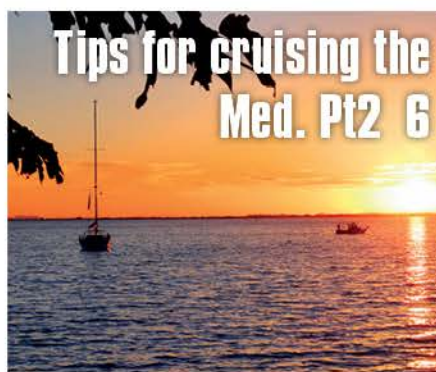
Tips for cruising the Med. Pt2 6