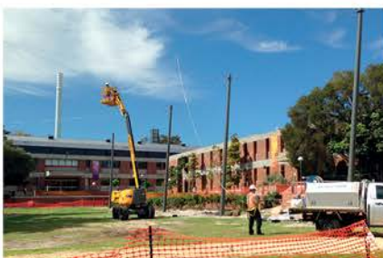
• Commercial Rigging