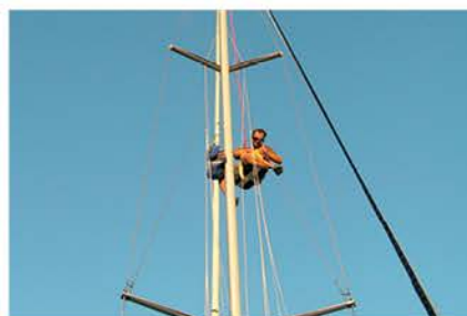
• Rigging & Mast Repairs