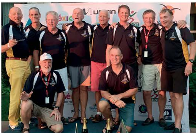
■ The successful aussie team.