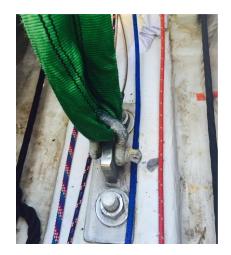
Fig 2. Shows properly rated shackle and lifting strop with tag.