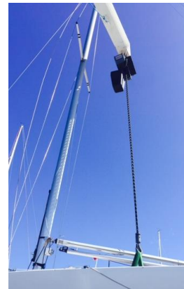
Fig 3. Shows that the vessel is securely attached at the fixed lifting points and the hook of the crane. Also correct alignment of crane to vessel.