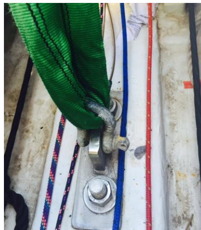
Fig 2. Shows properly rated shackle and lifting strop with tag.