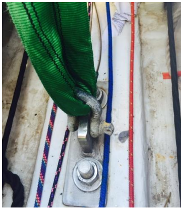
Fig1. Shows secure lifting point within the boat.